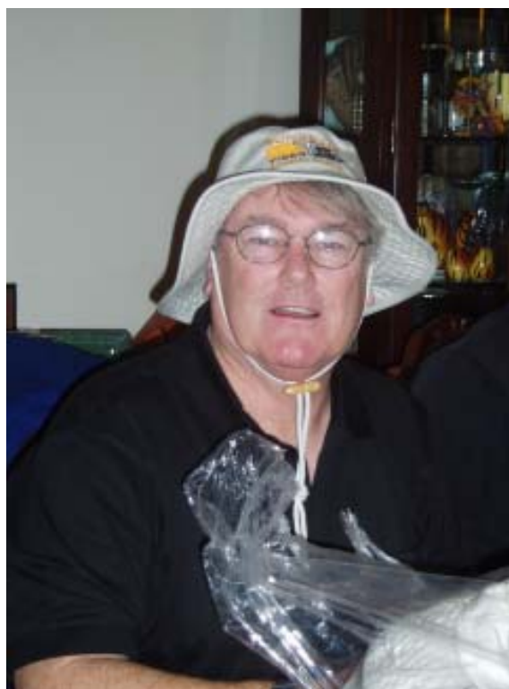
"Can I interest you in a slightly used Swaga-nator?"