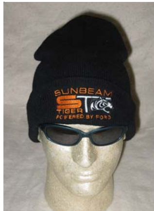
Hats - $18 Knit watch caps - $10 Sports bag - $15 Tiger soft coolers - $25 Visors - $15