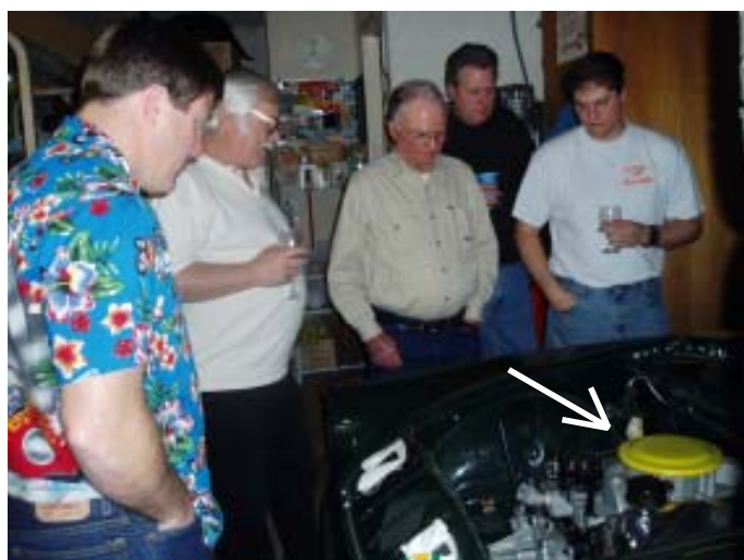
The group discusses whether this spacer is part of the LAT 3 Sunbeam Tiger Induction Kit, which will give a substantial increase in torque and horsepower to a car fitted with a LAT 20 Hi-Performance Camshaft Kit.