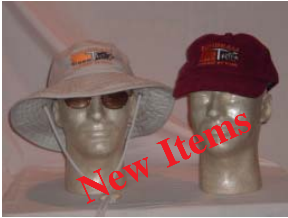
Aussie Hats $20.00, Hats $18 ea. assorted colors & styles Many more Items available.