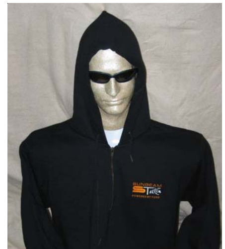
Hooded sweatshirts - $35 (black, gray) Youth hooded sweatshirts - $30 (black)

Contact Ron Willis 650-326-8042 or A66tiger@aol.com