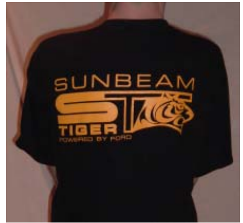
Short sleeve t-shirts - $18 (black, gray, red, maroon, navy, dark green) Long sleeve t-shirts - $20 (black, gray)